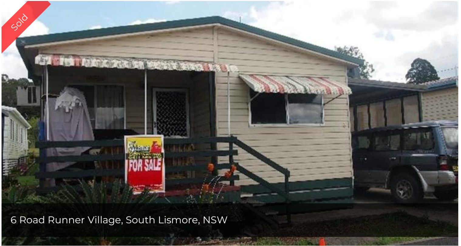
6 Road Runner Village, South Lismore, NSW