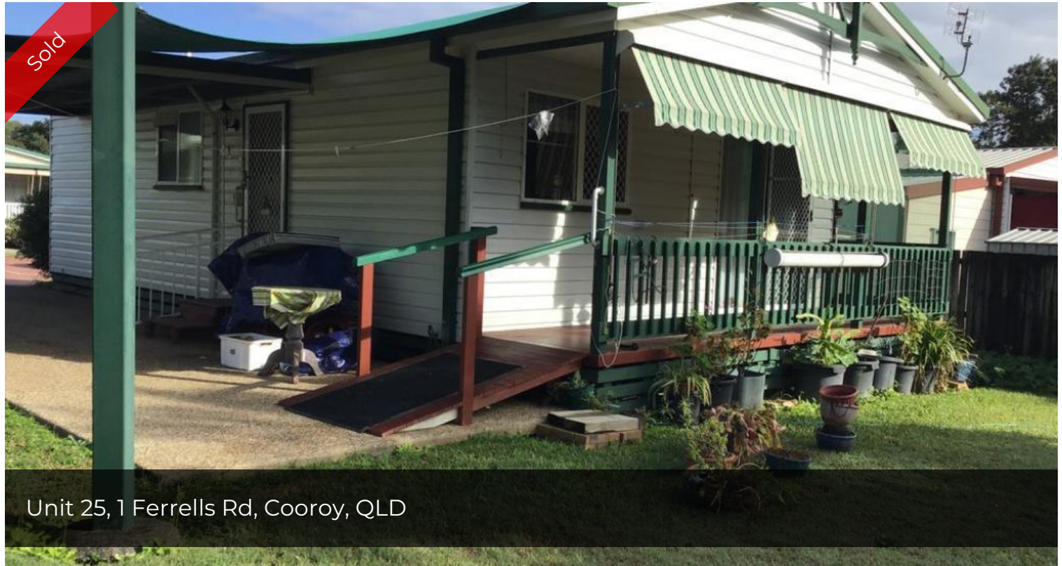
Unit 25, 1 Ferrells Rd, Cooroy, QLD