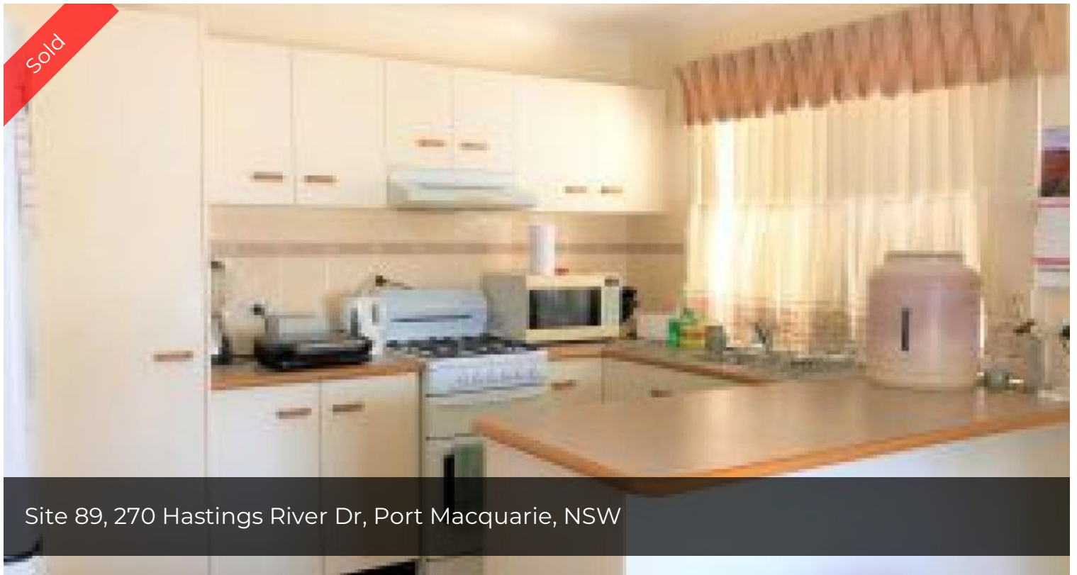
Site 89, 270 Hastings River Dr, Port Macquarie, NSW