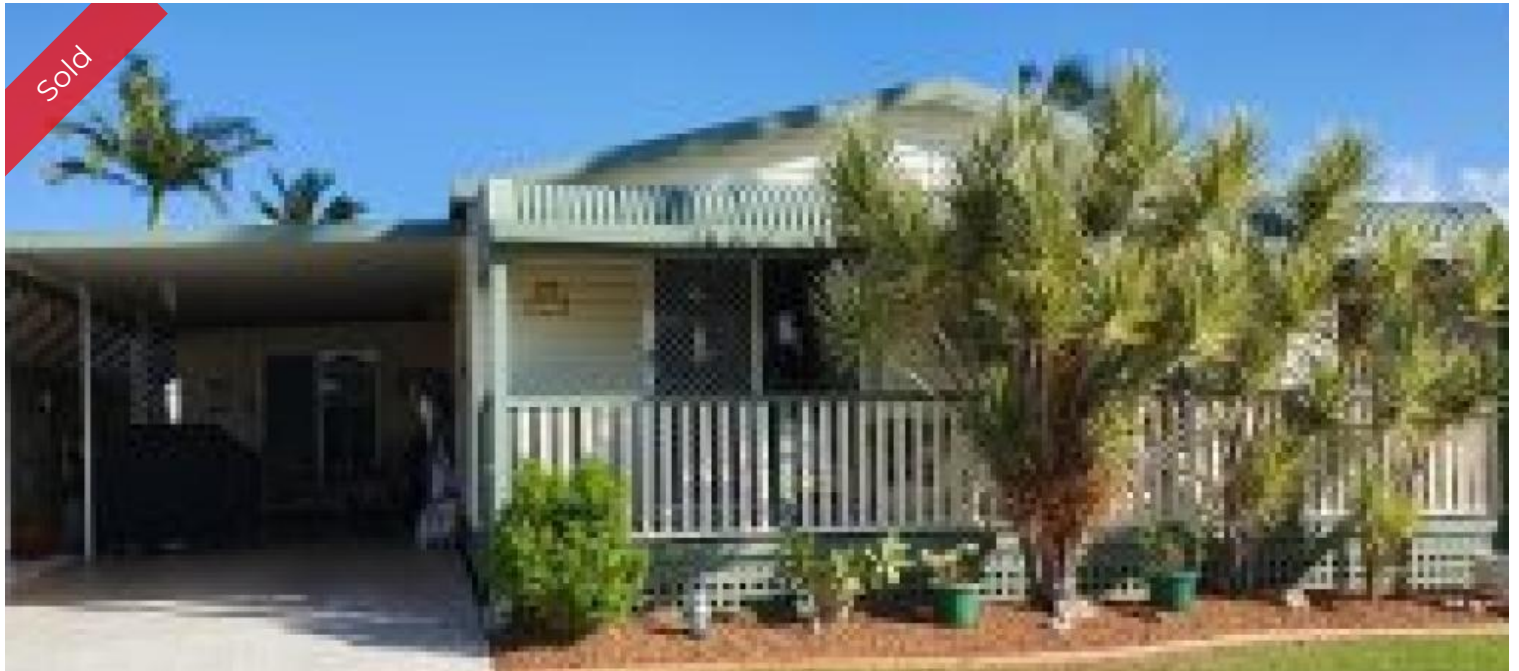
Unit 175, 34 Monarch Dr, Kingscliff, NSW