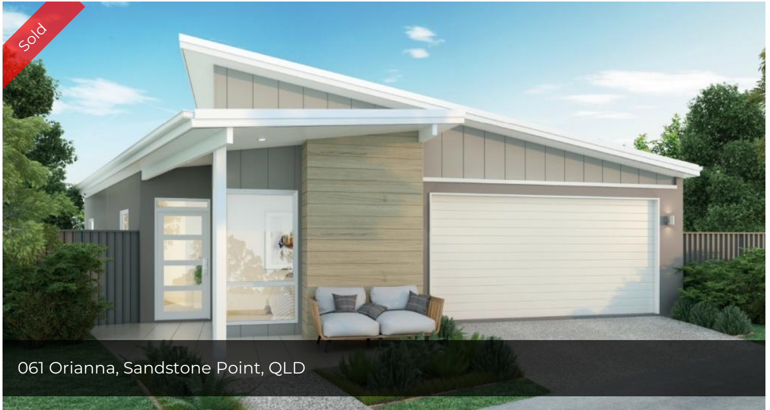
061 Orianna, Sandstone Point, QLD