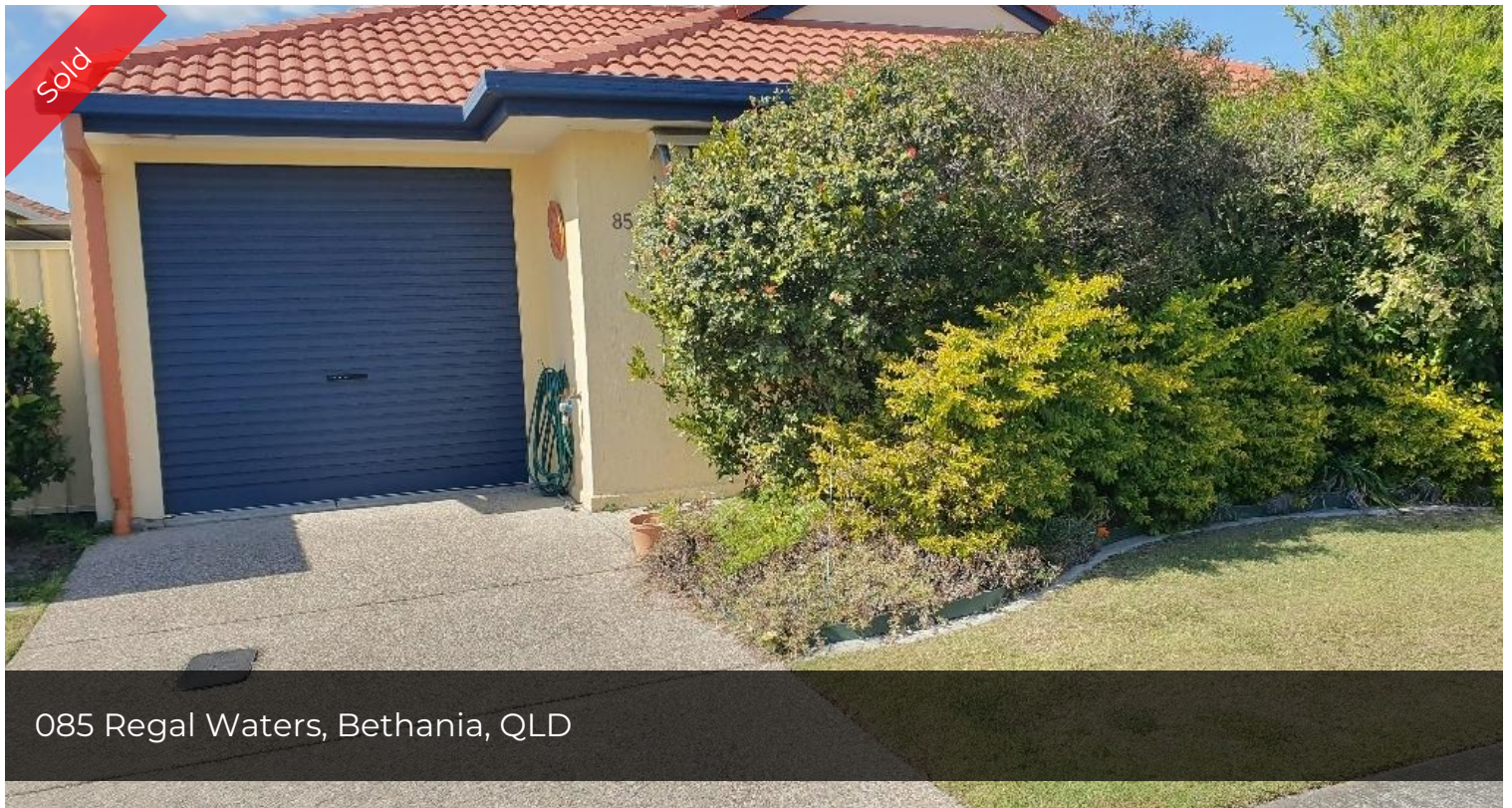
085 Regal Waters, Bethania, QLD