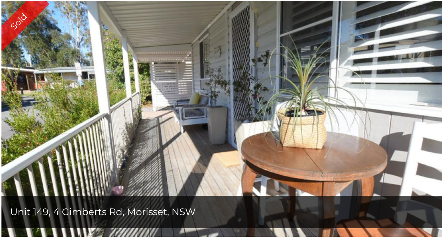
Unit 149, 4 Gimberts Rd, Morisset, NSW