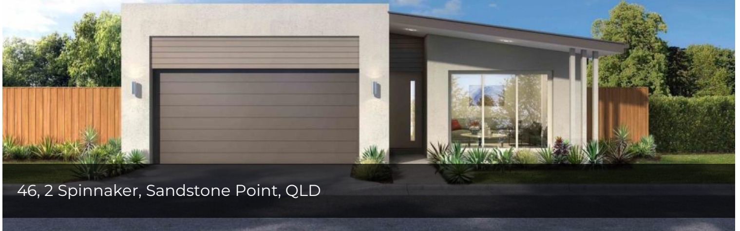
46, 2 Spinnaker, Sandstone Point, QLD