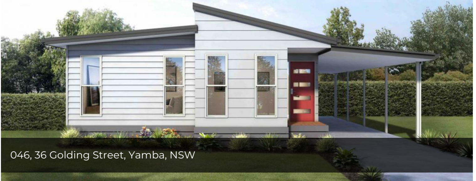
046, 36 Golding Street, Yamba, NSW