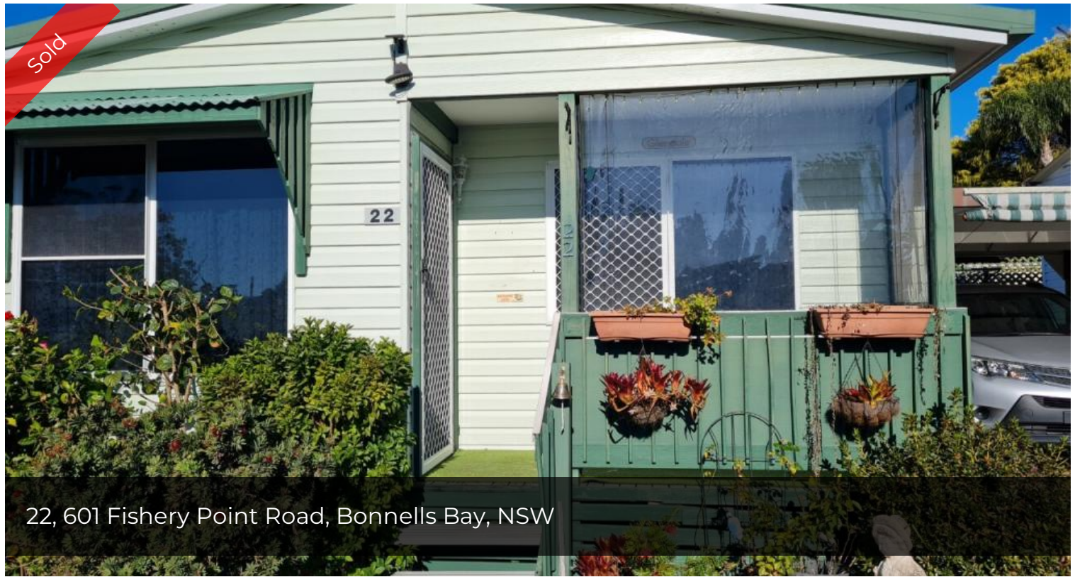
22, 601 Fishery Point Road, Bonnells Bay, NSW