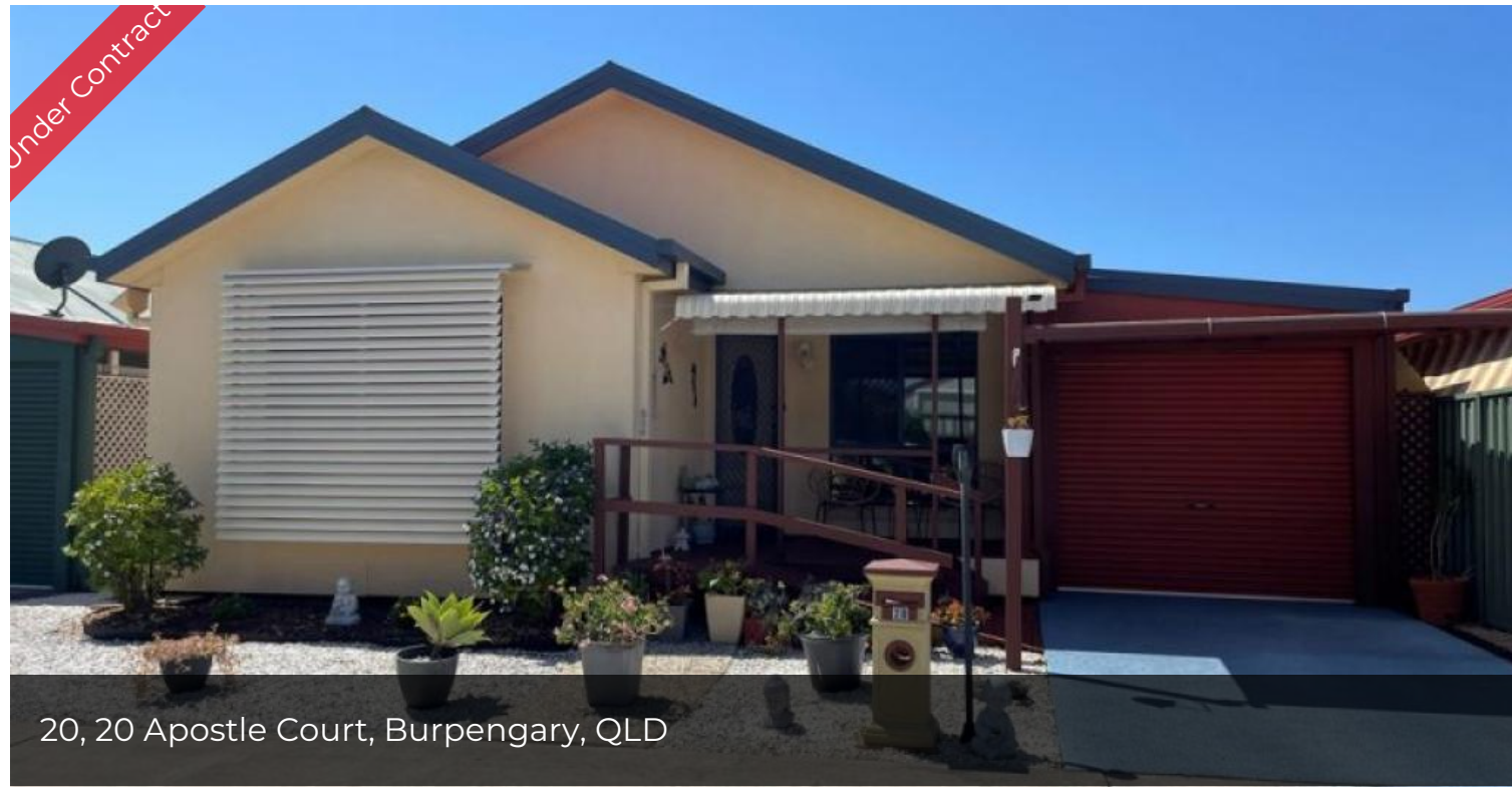
20, 20 Apostle Court, Burpengary, QLD